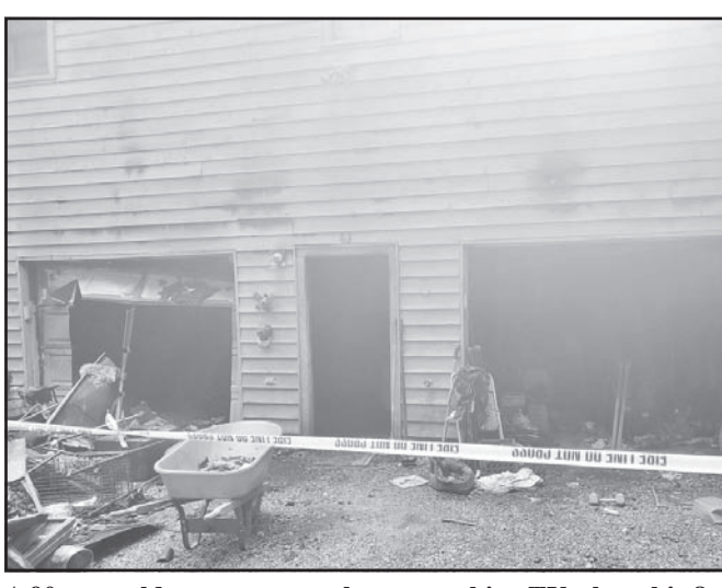
A 90-year-old woman was at home watching TV when this fire broke out in her basement. Fortunately, she's OK.