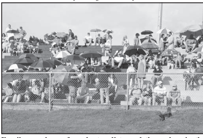
Family members of graduates distanced themselves in the stands and around the new turf field at Frank McClure Memorial Stadium during Friday's commencement.

Whatever lay ahead – be 'Every one of us has a it post-secondary education, entering the workforce or joining the military - the commencement ceremony served as an opportunity granting each graduating senior a special sense of closure before moving on to their individual next steps.